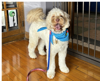
Jack is always ready with a smile!