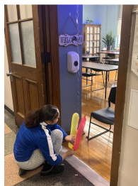
Ready for launch!