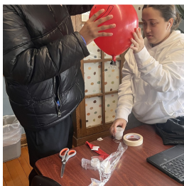
Preparing the balloon rocket.

Students in Astronomy/Oceanography at Crossroads Academy had fun participating in an astrodynamics project. Students were given various materials and balloons to create their own balloon rockets that would launch to a certain height. As an added challenge they had to add "payload", which is an astronaut's term for added weight on a rocket ship. The team that created a rocket with the most payload that successfully launched to the given height, won a prize!