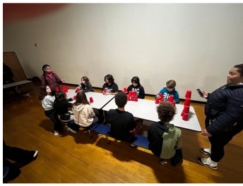
201 Reds help with MS PMU