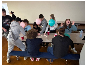
MS PMU is more fun with the 201 Reds!